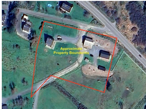
74 Old Blue Rocks Rd, Lunenburg NS B0J 2C0, CA