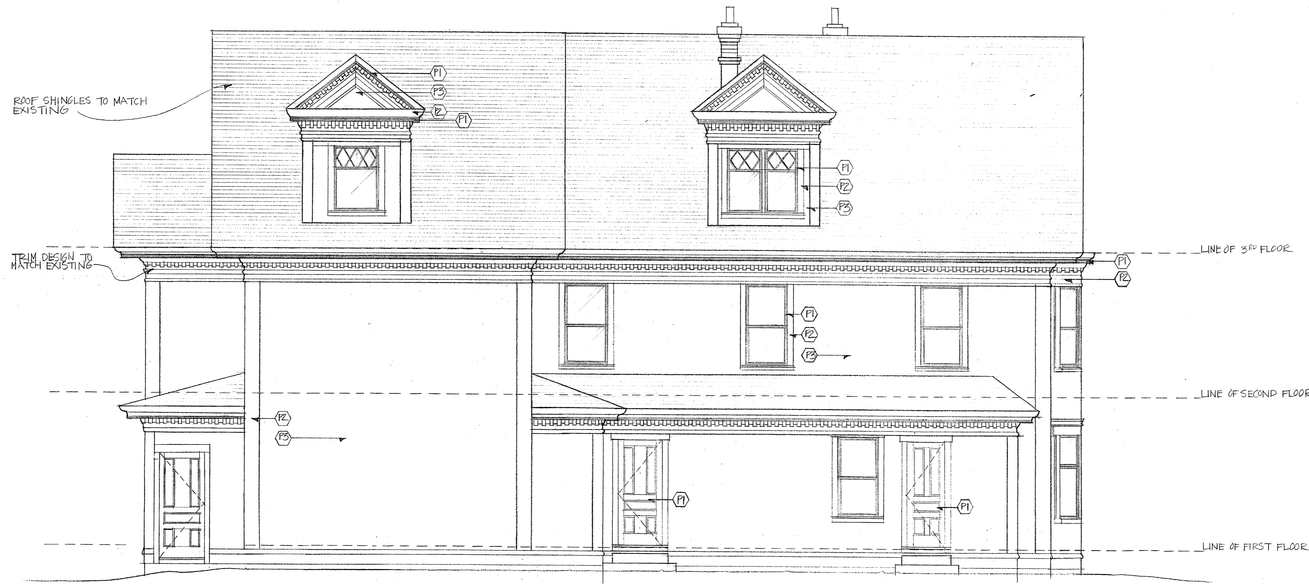
1 NORTH EXTERIOR ELEVATION AJO