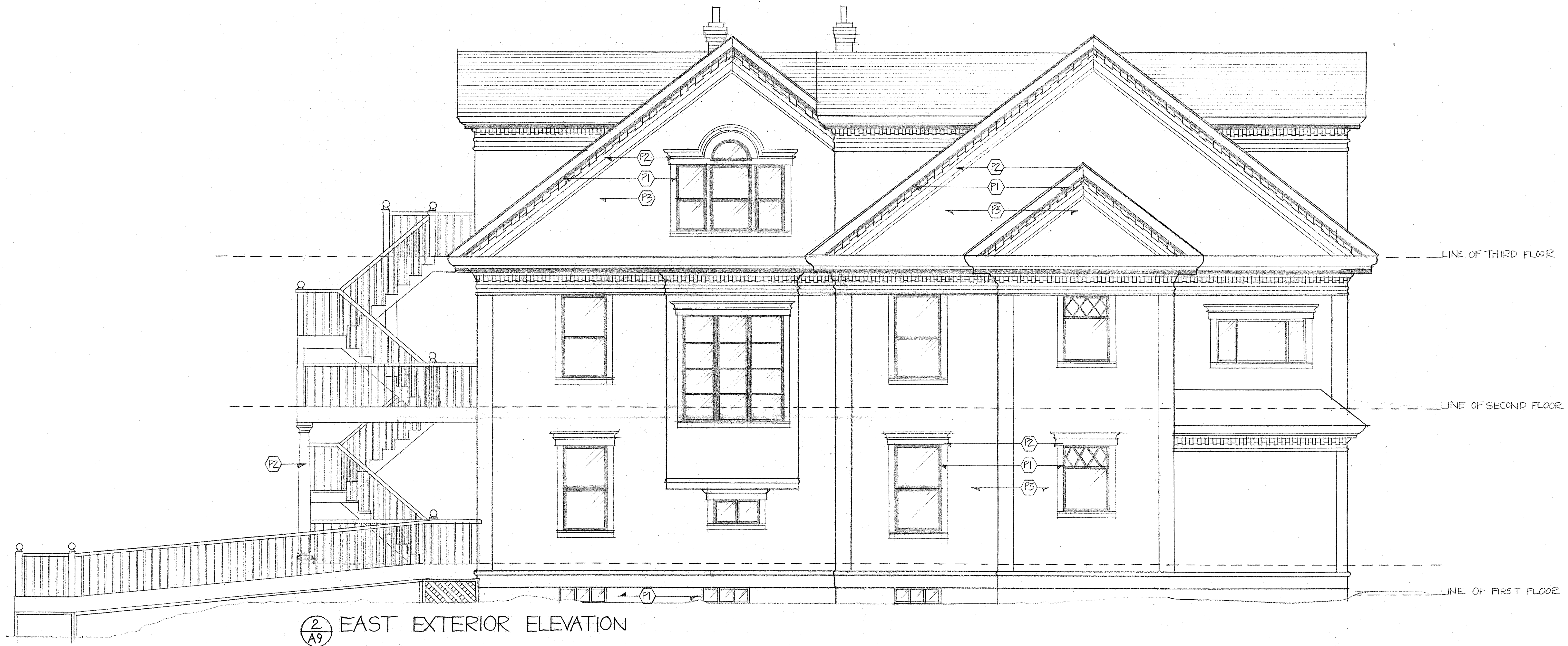
2 A9 EAST EXTERIOR ELEVATION