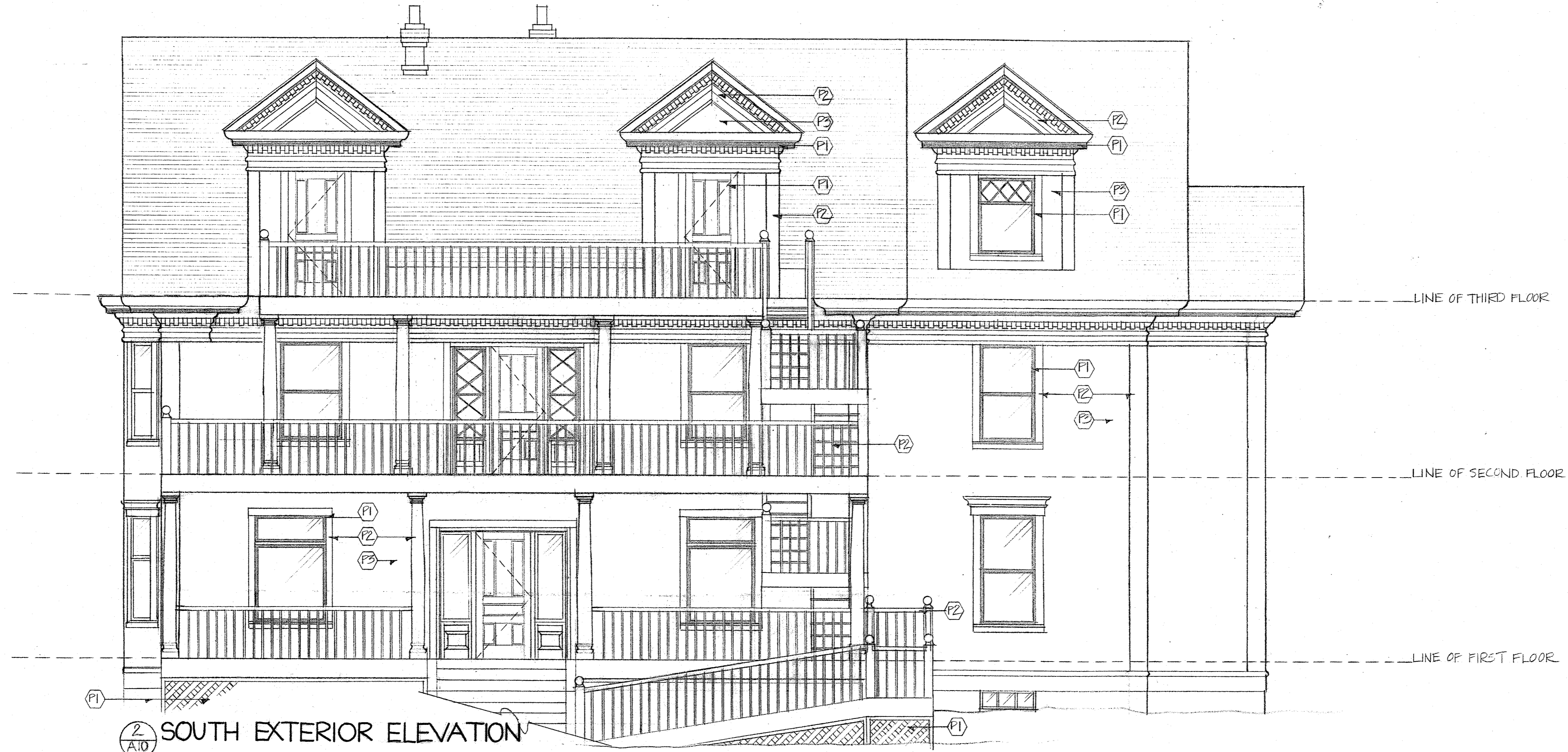
2 SOUTH EXTERIOR ELEVATION AJO