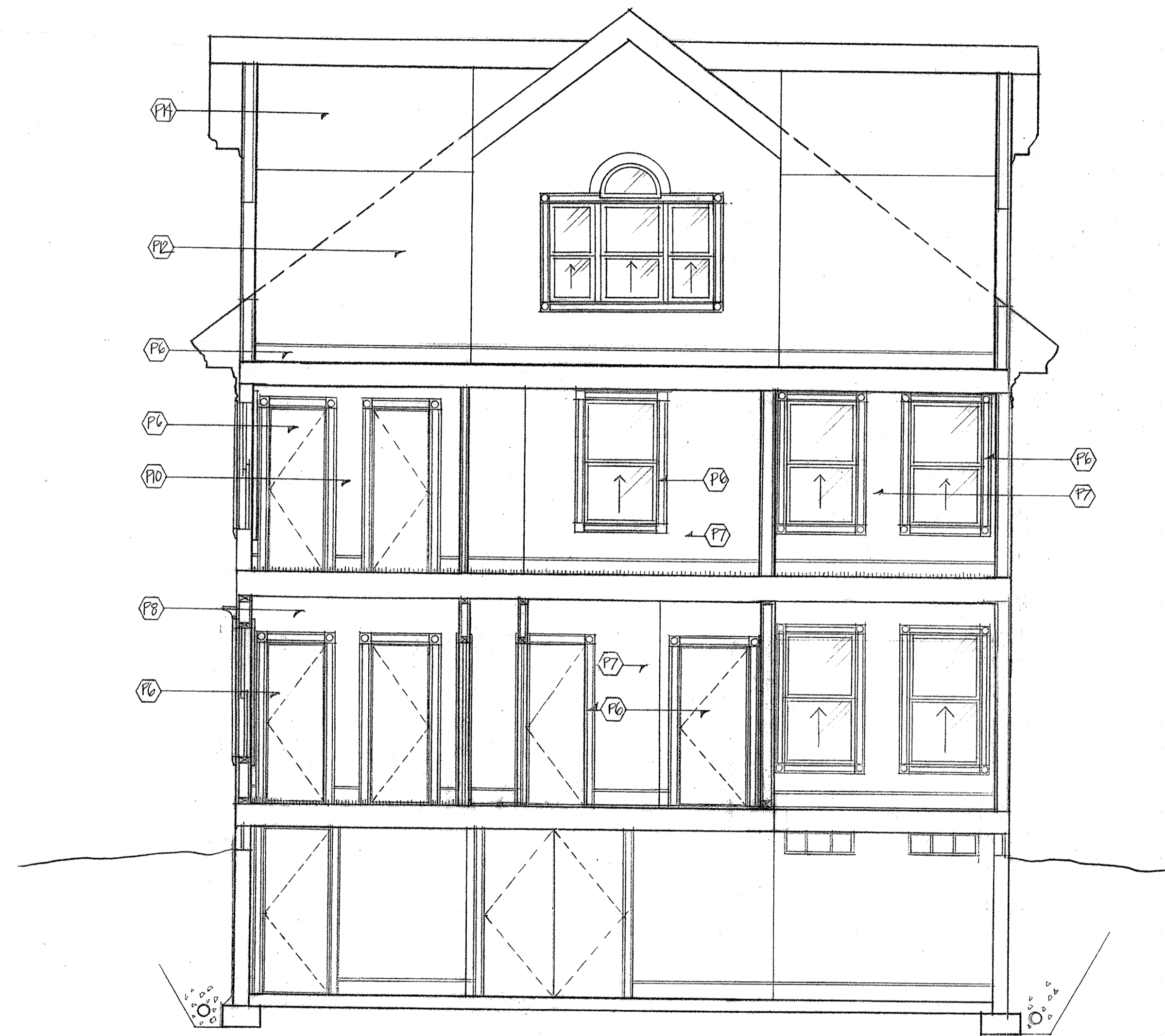
2 WEST CROSS-SECTIONAL DETAIL