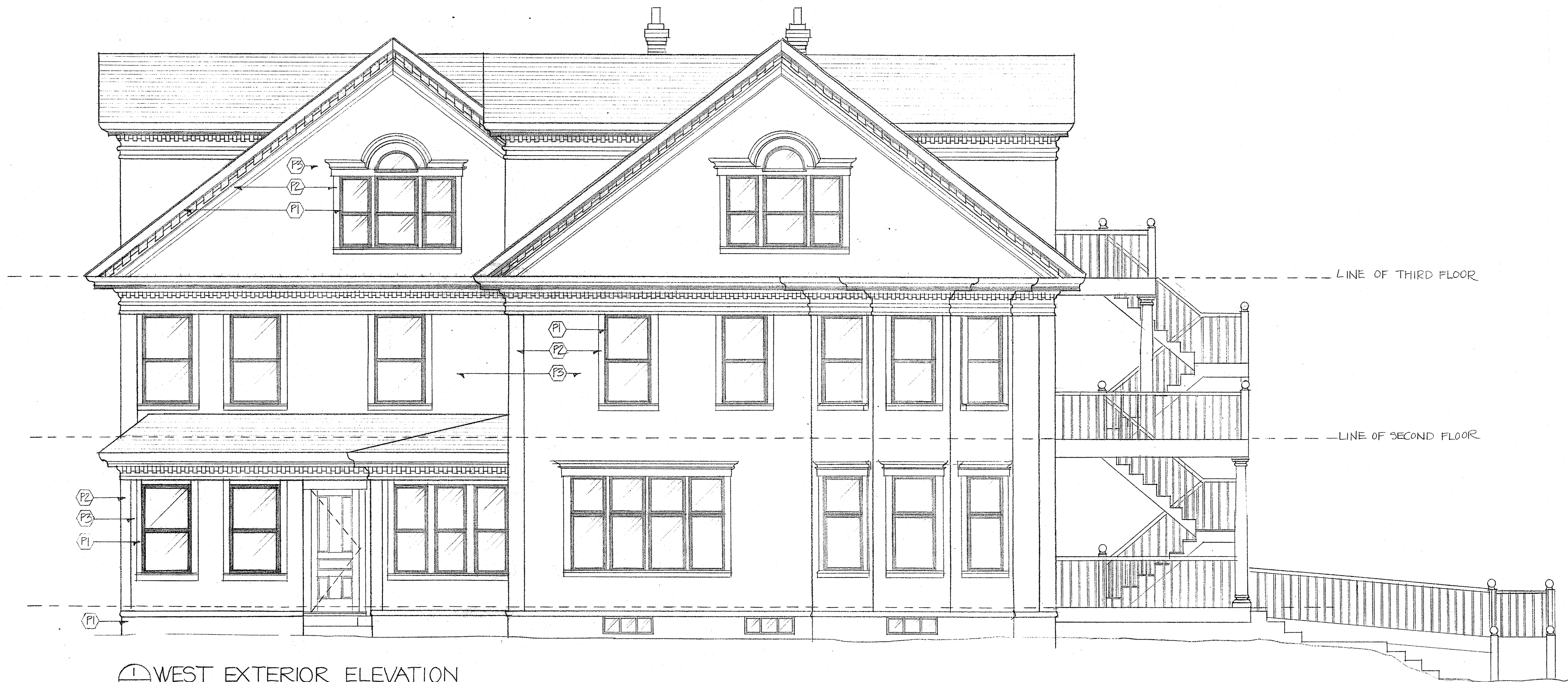
1 A9 WEST EXTERIOR ELEVATION