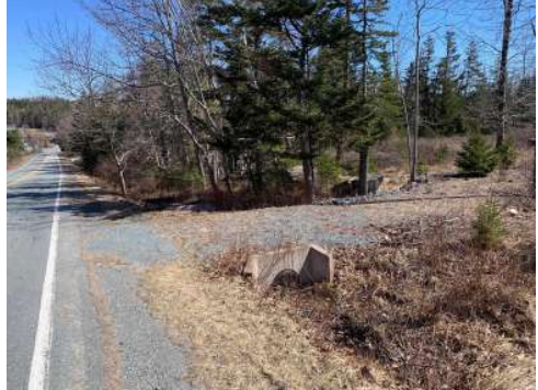
Data provided by the Nova Scotia Association of REALTORS®.