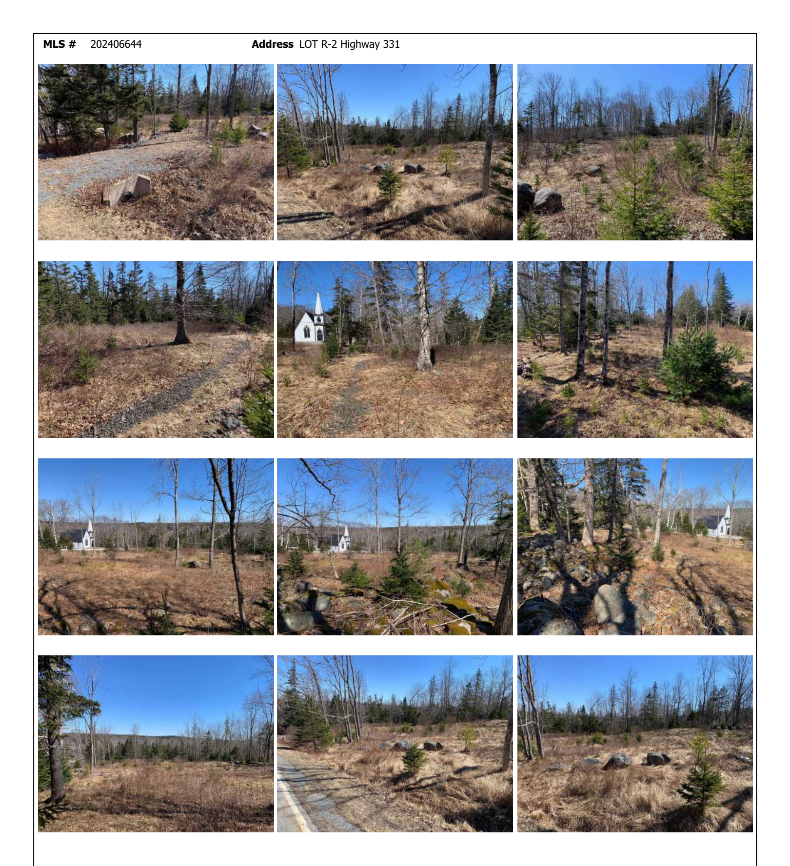
All information displayed is believed to be accurate but is not guaranteed and should be independently verified. No warranties or representations are made of any kind.